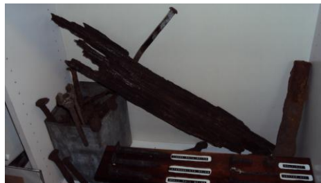
Items from the J.C. Penney narrow-gauge Railroad