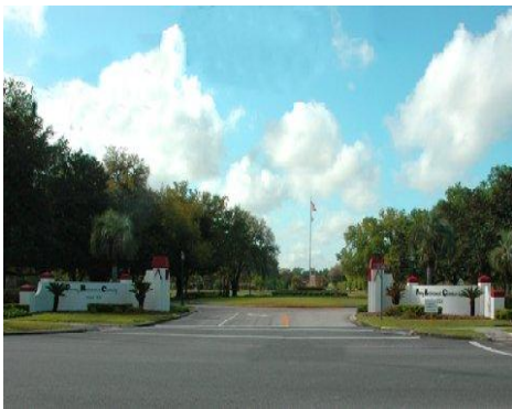
View looking down Poling Blvd from S.R. 16 to Penney Memorial Church

The Drake Elms planted, in 2011, with the help of a Urban and Community Forestry Department Grant have grown strong and healthy. They provide an attractive border down both sides of Poling Blvd leading to Penney Memorial Church. If you drive the S.R. 16 corridor be sure to take a side-trip to see the magnificent church building. This is the best example of French-Norman architecture in the area and well worth a visit. The building is open from 8:00a.m.– 5:00p.m daily, with services at 10:30a.m on Sundays. Beginning in the Fall, a listing for the 2013-2014 series of commemorative concerts will be found here & on the web-site. These concerts are free.