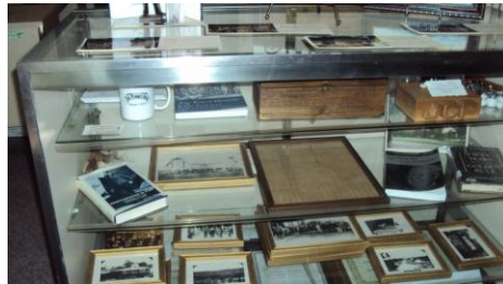
One of the cabinet displays