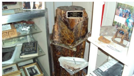
The once familiar "Cat's Face" turpentine collector

The Corridor Management Group looks forward to submitting grants during 2013-2014 to expand the